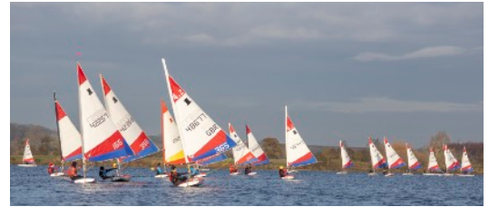
Topper Traveller at the club had 5 out of top 6 in the fleet - congratulations