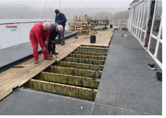
A few of the decking team at work - thanks to all who contributed to the 220 hours of time it took to make the decking much safer.