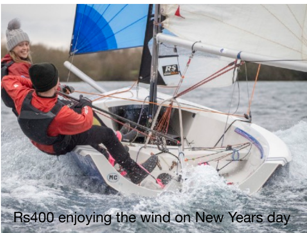
Rs400 enjoying the wind on New Years day

January 25 11/12 NCSC Safety Duty course 18/19 U 19 training 25/26 County Cooler 2025